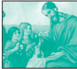
FIGURE IT OUT