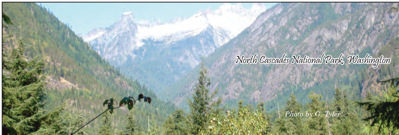
North Cascades National Park, Washington

Presently, the copies we have available are from the years 2001 through 2016.