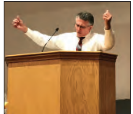
Praise the Lord for all He has done!