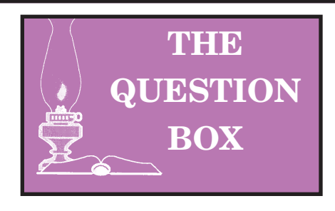
Answered by the Editor