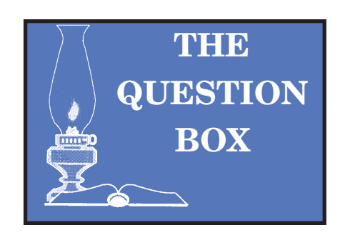
Answered by the Editor

UESTION: What effect does sanctification have on personality defects, inherited traits, childhood scars, habits, addictions, etc. (I have seen and heard people whom I believe to be saved and sanctified speak sharply, be impatient, be controlling, want to be in the spotlight, hold grudges or be unforgiving, consider themselves more intelligent or talented or better than others, have an anger problem or get angry when someone disagrees with them or overlooks them or crosses them, etc.)—Anonymous