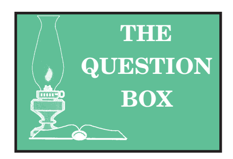
Answered by the Editor

UESTION: What verses in the Bible do preachers use when they preach eternal security?